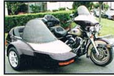
95 Harley Davidson with Escort Painted Two Tone